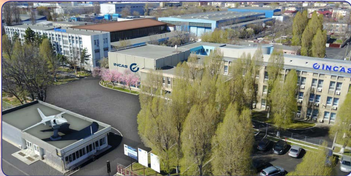
INCAS - National Institute for Aerospace Research "Elie Carafoli"

For more informations see Route map of Bucharest.